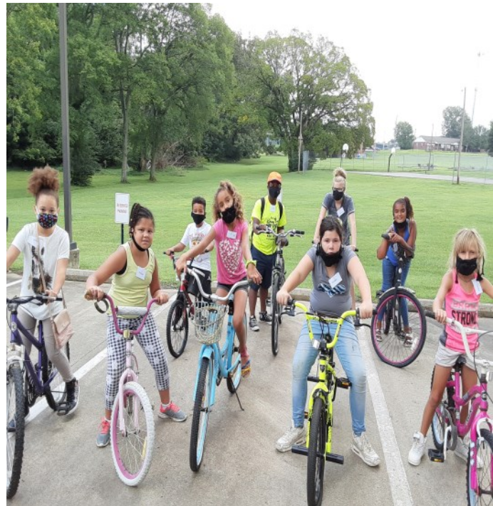
(see page 3 for more event photos)

CHA provided a three-week summer enrichment program for 20 youth. The youth learned how to repair bikes, garden, music, art, and yoga. The program was lead by CHA Resident Coordinator and Resident interns, along with other community partners. This collaboration provided classroom facilitation snacks, lunches, and transportation to all campers.